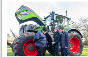
Agriculture Engineering Workshops