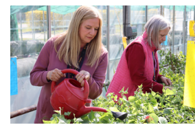
Horticulture Glasshouses and Polytunnels